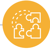
Requirements imposed by the four outcomes