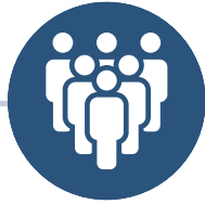
Requirements imposed by the new Cross Cutting Rules