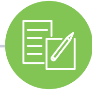
Documentation updates, initial disclosure and sales processes