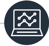
'Friction' and 'sludge' practices