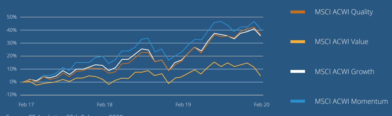
Figure 2: Market Cap Performance, 3 year cumulative total returns